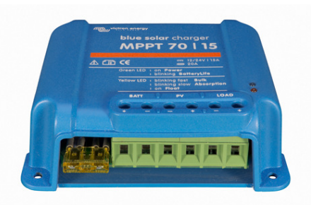
Solar charge controller MPPT 70/15